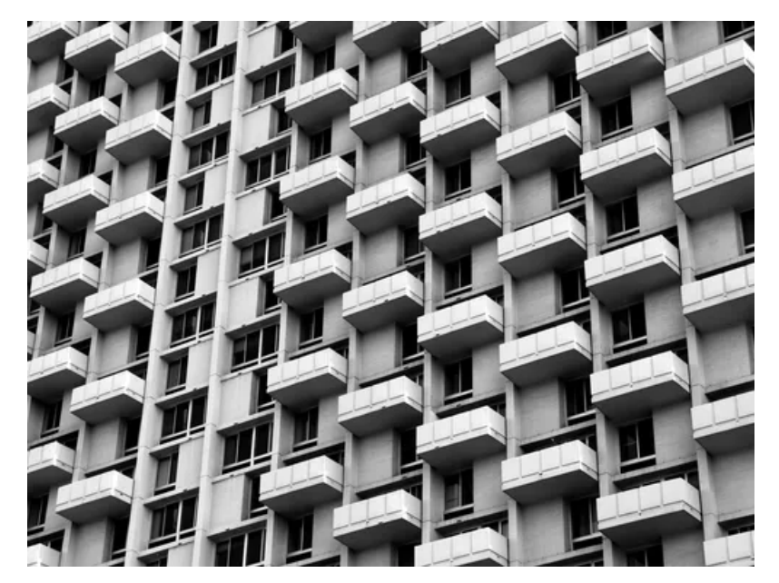
Your basic tenant rights in Philly, explained