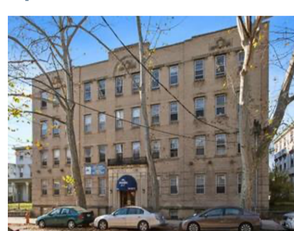
Florence Garden Apartments - 56 Units 506 S. 41st Street; Philadelphia, PA