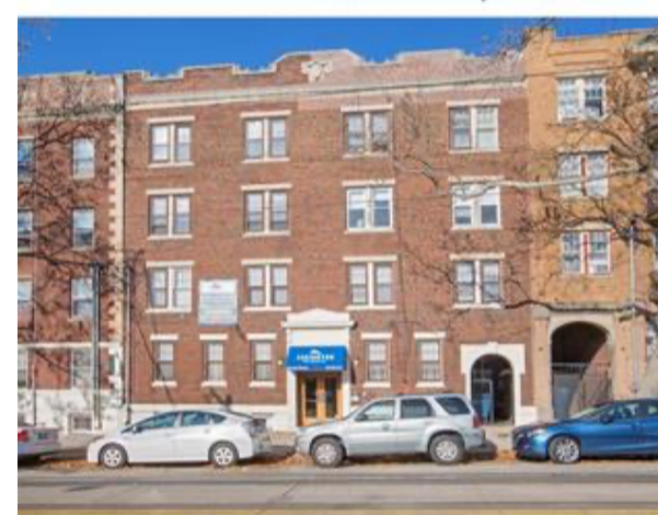
The Lexington - 43 Units 4207 Chester Avenue; Philadelphia, PA

The Lexington and Florence Garden Apartments