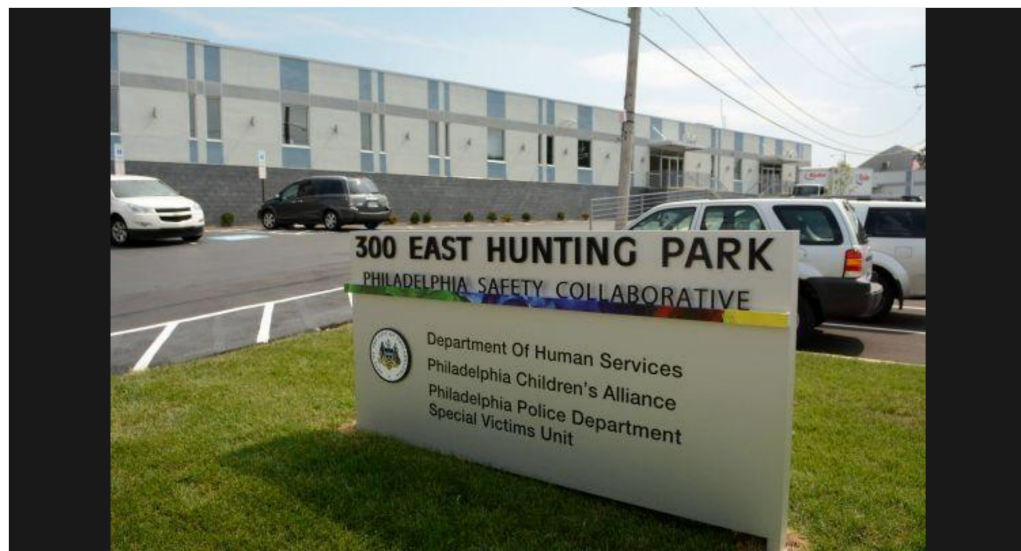
Philadelphia Safety Collaborative, the newly co-located site for members of the Philadelphia Department's Special Victims Unit, the Department of Human Services Sexual Abuse Investigation Unit, the Philadelphia Children's Alliance and staff from the District Attorney's Office.